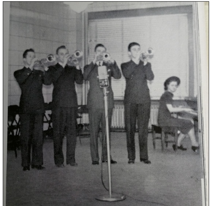
The Trumpet quartet from the 1940 yearbook.

Do you have any Westmar items you would like to donate to the Archives or for room display? We are also looking for Sports Memorabilia as well as items from other groups for display. Good copies of photos or certificates are also welcome.