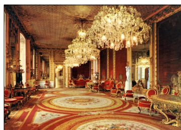
Stockholm Royal Palace