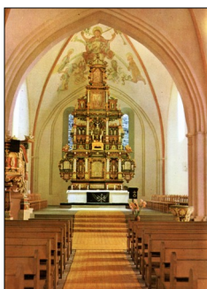
Varel i. O. Ev. Kirche