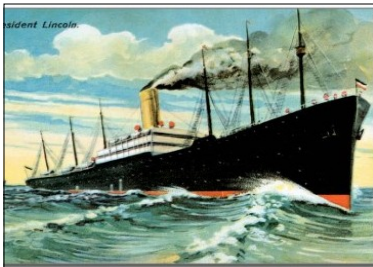
This large German commercial ship was trapped in American waters when WW I began in 1914 and was held in a New York harbor until the U.S. entered the war.