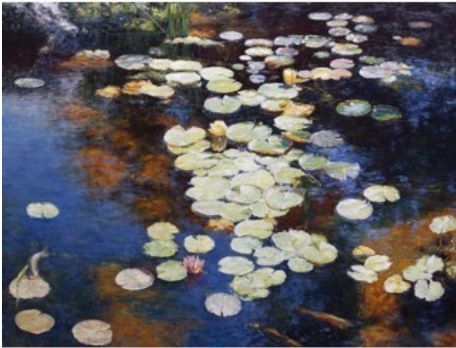
Lily Pad Shelter Oil on Canvas