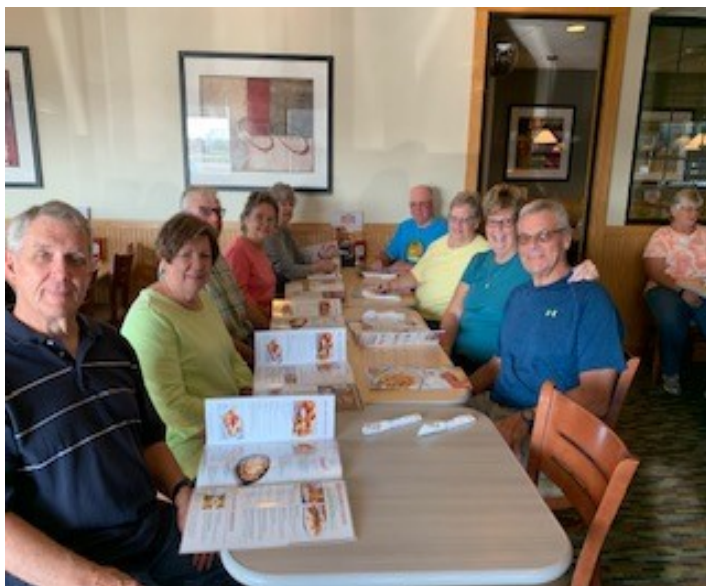
Members of the Class of 1969 met at the Iowa Great Lakes this year.