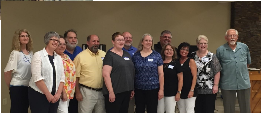
Madrigal Singers at Reunion