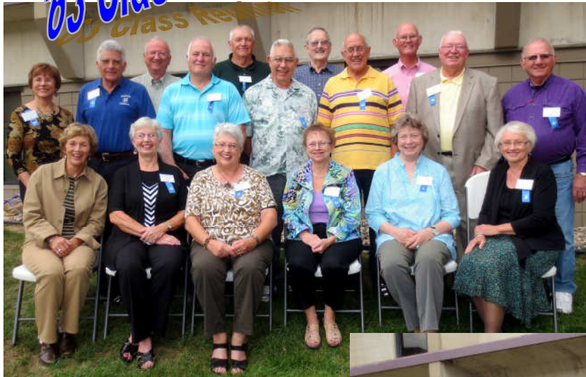
Class of '63