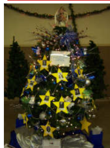
The 2013 Pioneer Village Christmas Tree in Le Mars. Religious Vocations theme.