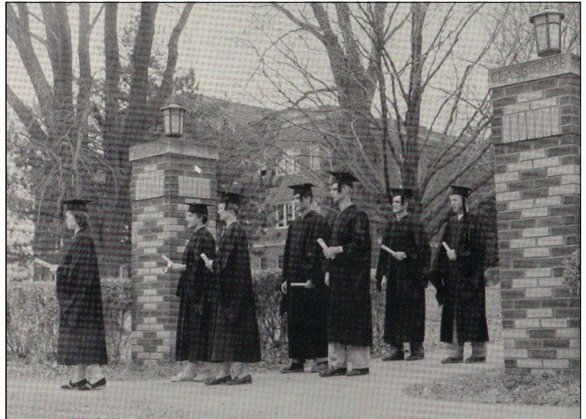
Graduates from the '53 yearbook—who are they?