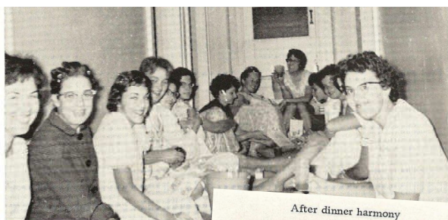
After dinner harmony