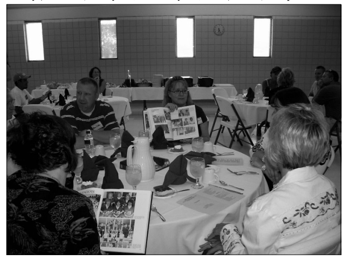
A walk down memory lane with some friends and yearbooks