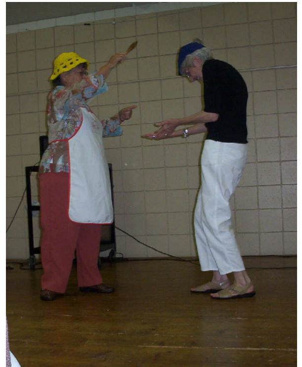
Jack was a naughty boy who sold the cow for a handful of beans in “Jack and the Real Flip Bean Stock,” the Freshman year talent skit put on by members of the Class of 1959.