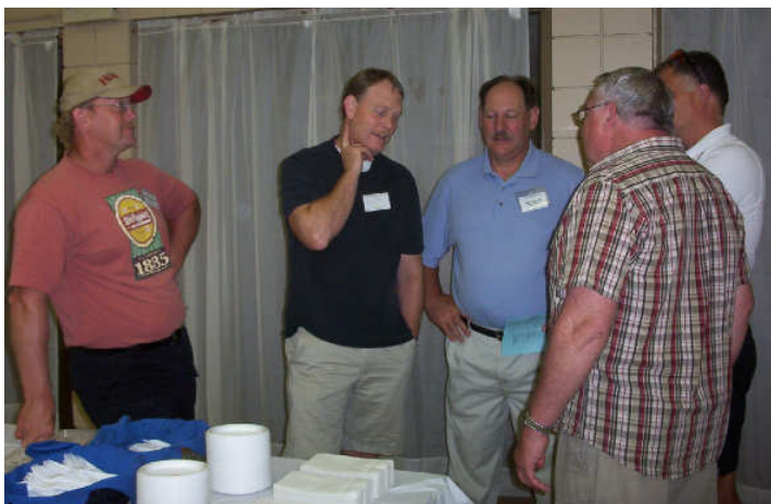
Talking over old times.