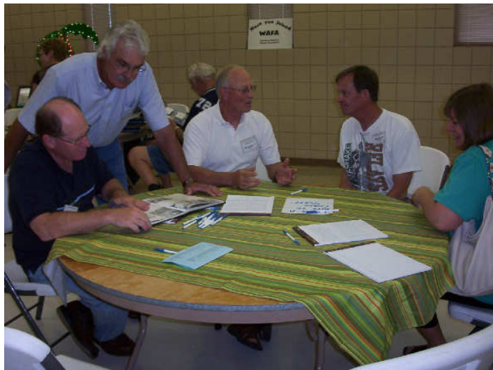
Remembering fond memories and telling stories was the main theme of the reunion.