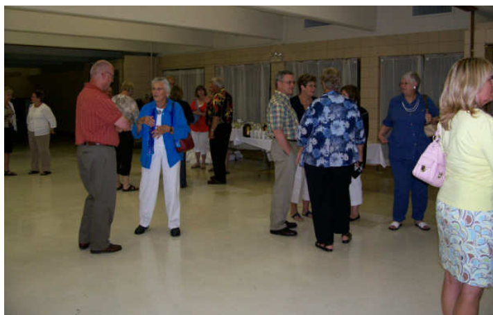
Even after the tables were taken down and the chairs put away, the visiting went on.