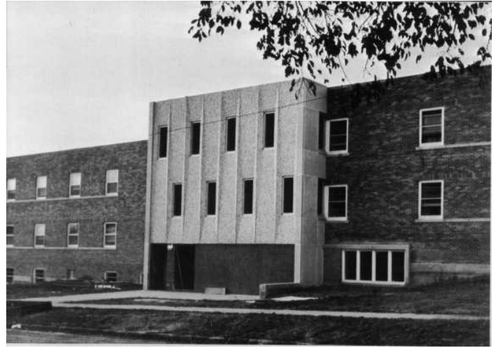
From: The 1964 Eagle yearbook

In the 1960's the two dorms were connected with an architectural design that provided additional rooms and a common lobby space. The Koehler name was