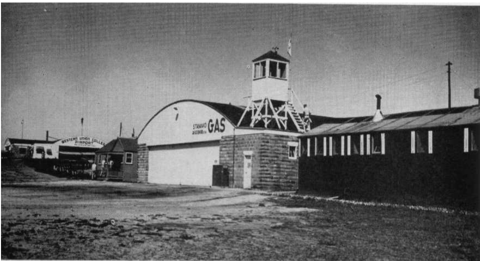
way No. 75 and the Illinois Central and Control tower, office and two of the three hangars at the college airport.