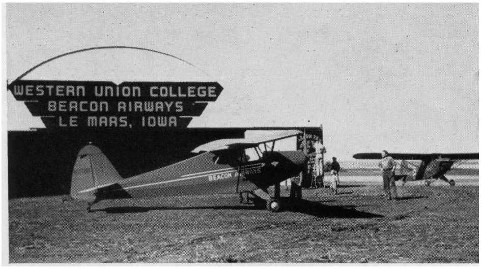
Western Union College Airport (taken from the 1941 Eagle yearbook)