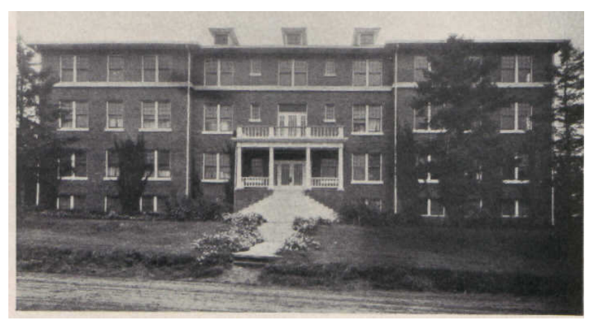
Wernli Hall—West View (taken from the 1924 Pilot yearbook)

bottom. This made it possible to call to the were forced to find housing elsewhere and cluded.