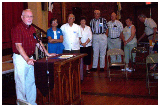
Everyone got their turn at the microphone to tell what has happened in their life during the past 50 years.