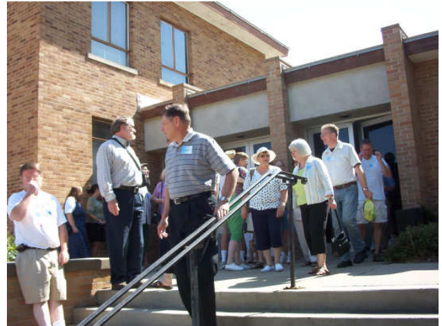
Touring Mock Library; a building that was familiar to some and new to others.