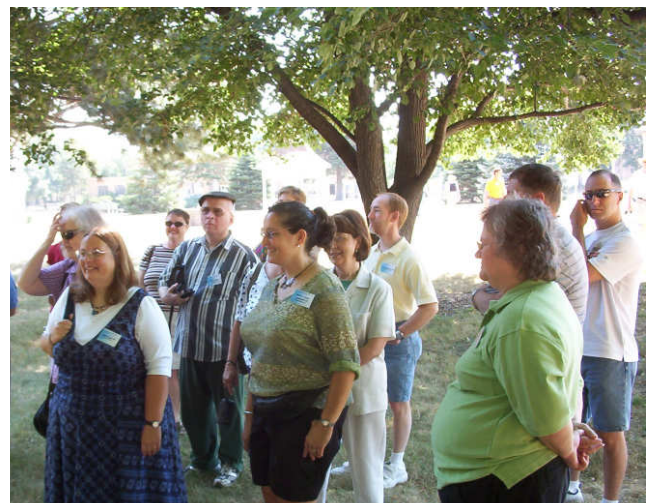
Resting a moment under a shade tree, the campus tour group broke into song singing the School Song.