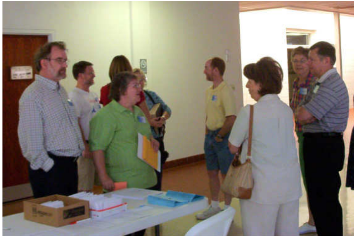
Reminiscing around the registration table.