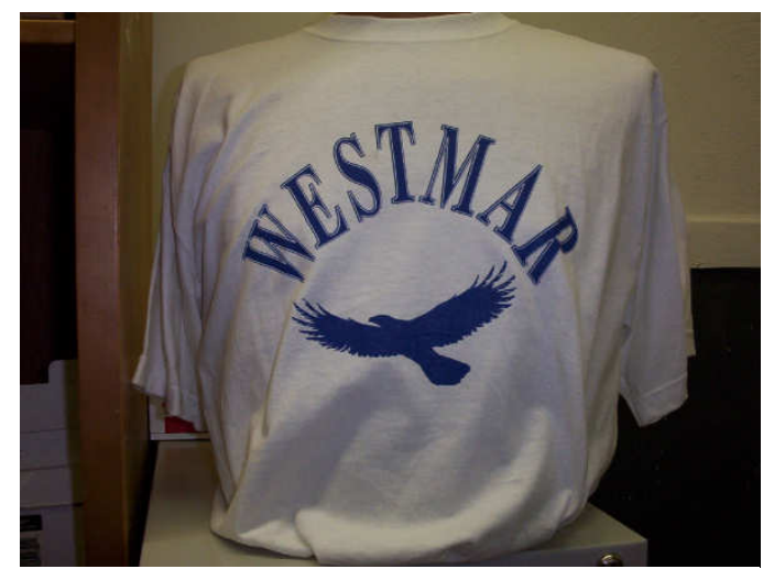
Sale: Discontinued white Westmar tee shirts with blue lettering are now on sale for $10.00 for small, medium, large and extra large, while they last. Sizes 2XL and 3XL are $12.00.

Need a gift idea? How about a membership who isn't a member? Give us their name and we will send them a complimentary issue of our newsletter.